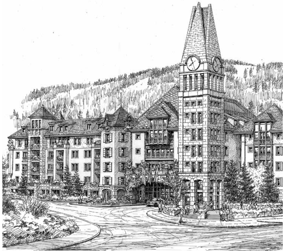
View from Northwest

location: Vail, Colorado total square feet: 538,600 gross sq ft 71 condominiums 45 club units BOH, amenities, circulation, and utilities 111,000 sq ft; 398 parking spaces 145,000 sq ft construction start: July 2007 construction completion: August 2010 client: Vail Resorts Development Company, The Ritz-Carlton Residences, Vail, The Ritz Carlton Club, Vail