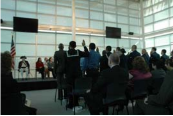
The centerpiece of the building is the Ceremony Room. New Americans take the oath of citizenship in this soaring space that is filled with light.