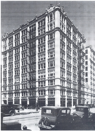
Igoe Mercantile Exchange Building c. 1930, Chicago, IL

As of June 1st, the Chicago studio of 4240 Architecture has relocated from Depaul's Richard M. and Maggie C. Daley Building in the Loop to an adaptive reuse development at Jefferson and Van Buren in Chicago.